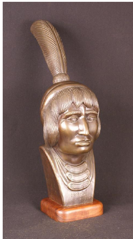
Willard Stone, 'Osceola', bronze 23 ½" x 6 ½", $8,000, (#3705)