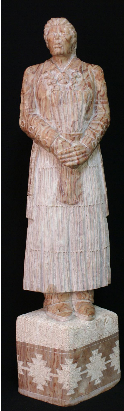
Alvin Marshall, 'Walks Safely on Mother Earth' Alabaster, 18" x 12" x 10", $4,500