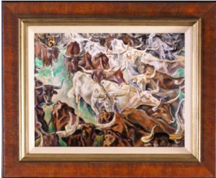
Charles Banks Wilson, 'Longhorns, Cattle Drive', acrylic, 12 7/8" x 9 7/8", $6,000, (#2914)