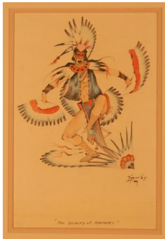
Jerome Tiger, 'Beauty of Feathers' colored pencil 11 \frac{3}{4} " x 9", $4,500, (#12.66)