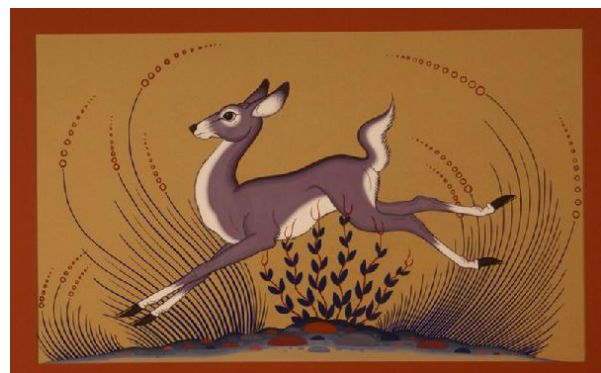
Acee Blue Eagle, untitled purple doe Gouache, 11" x 18 ½", $10,000