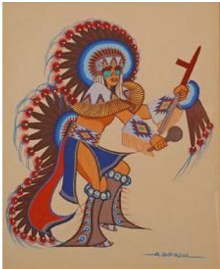
Archie Blackowl, 'untitled', tempera 13" x 11", $850, (#3839)