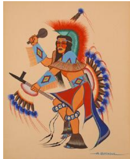
Archie Blackowl, 'untitled', tempera 13" x 11", $850, (#3840)