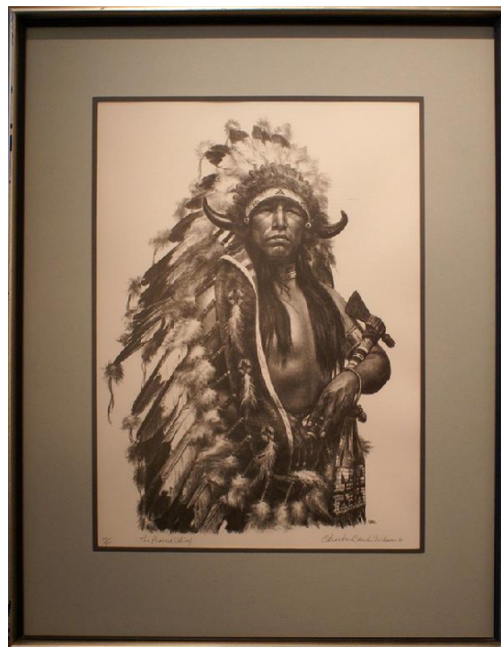
Charles Banks Wilson, 'Prairie Chief' (1985) Lithograph, 17 ½" x 12 ¼", $4500, (#345)