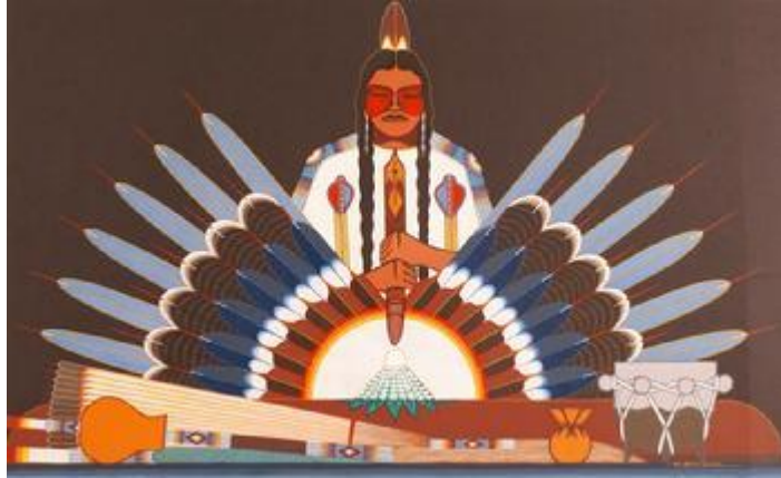
Archie Blackowl, 'Mother's Prayer', Cheyenne, gouache 19 ½" x 31 ¼", $2,450, (#3275)