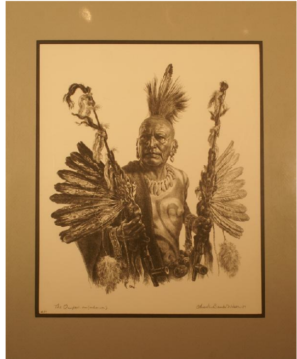
Charles Banks Wilson, 'Quapah', 16" x 13 ½", $1800, (#7.1010)