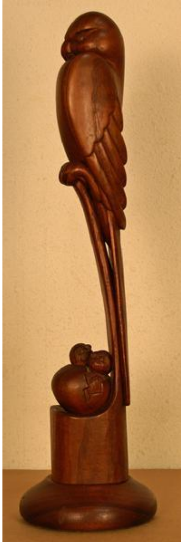
Willard Stone, 'To Each His Own', (1978) Wood, 19 ¼" x 5" x 5", $15,000, (#3266)