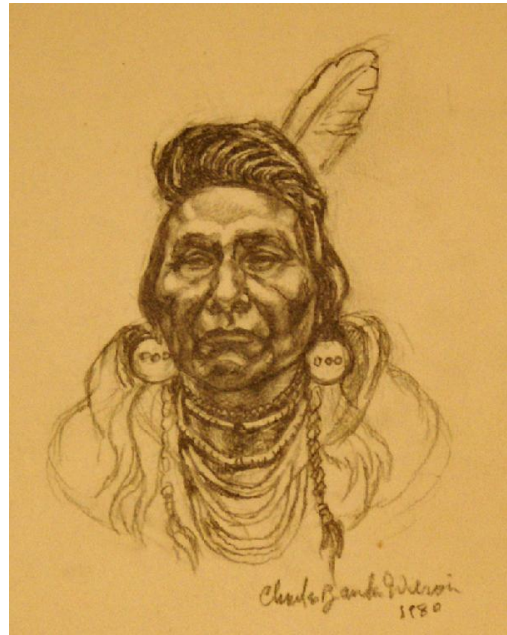
Charles Banks Wilson, 'Chief Josph', (1980) pencil, 14" x 8", $8,000, (#2917)