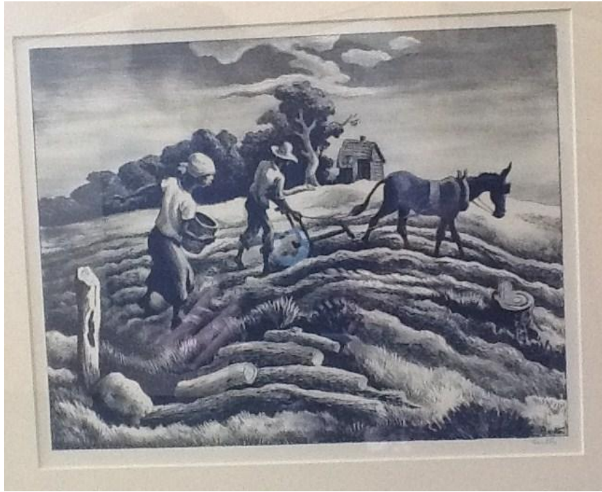
Thomas Hart Benton, 'Planting', lithograph, 11" x 13", $3500, #711