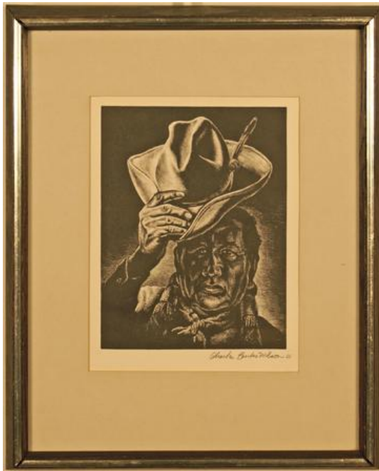
Charles Banks Wilson, 'Black Owl', (1967) 7 ¾" x 6", $950, (#986)