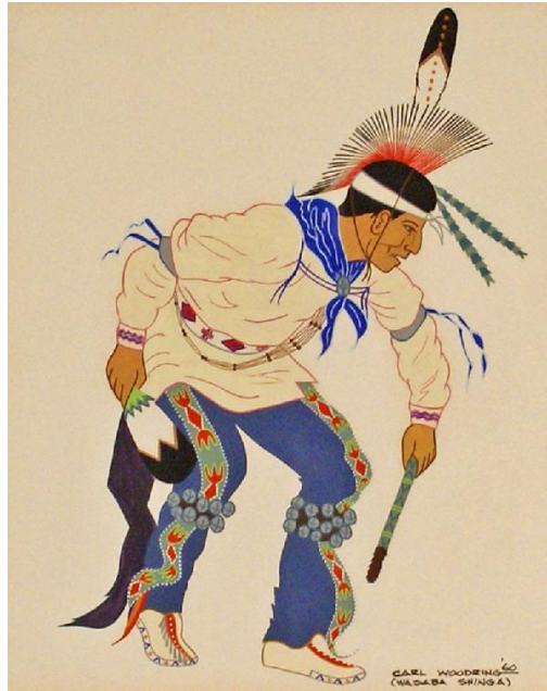
Carl Woodring, Osage, untitled, (1960) tempera, 10 \frac{3}{4} " x 8 \frac{3}{4} ", $2,200, (#10.164)