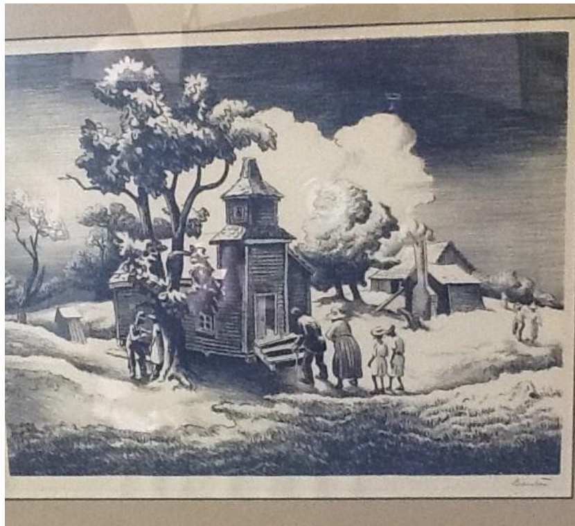
Thomas Hart Benton, 'Sunday Morning', lithograph, 13 1/4" x 18 1/4", $3500, #713