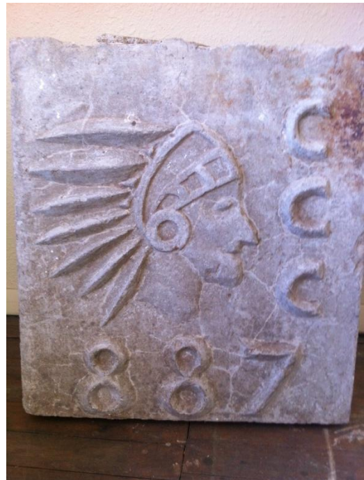
CCC block, cement, 19" x 17" x 6", $325