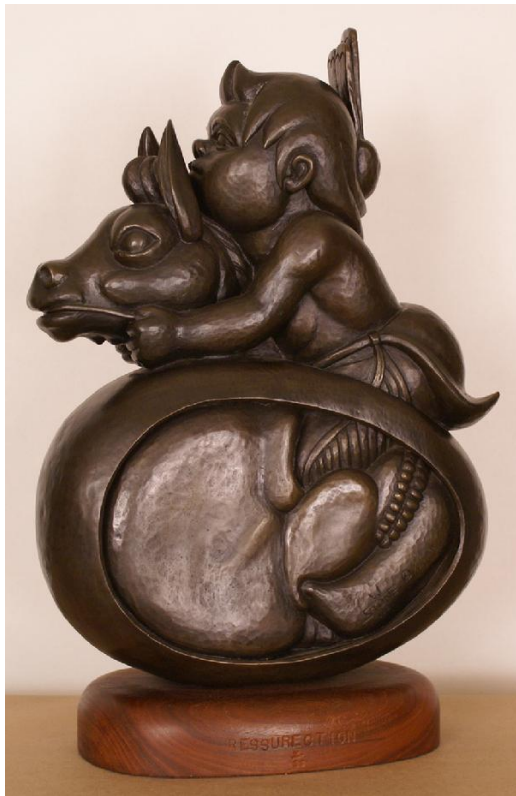
Willard Stone, 'Resurrection', 7/16, (1980) 20 1/2" x 12 ½" x 6 ½", $9,000, (#3284)