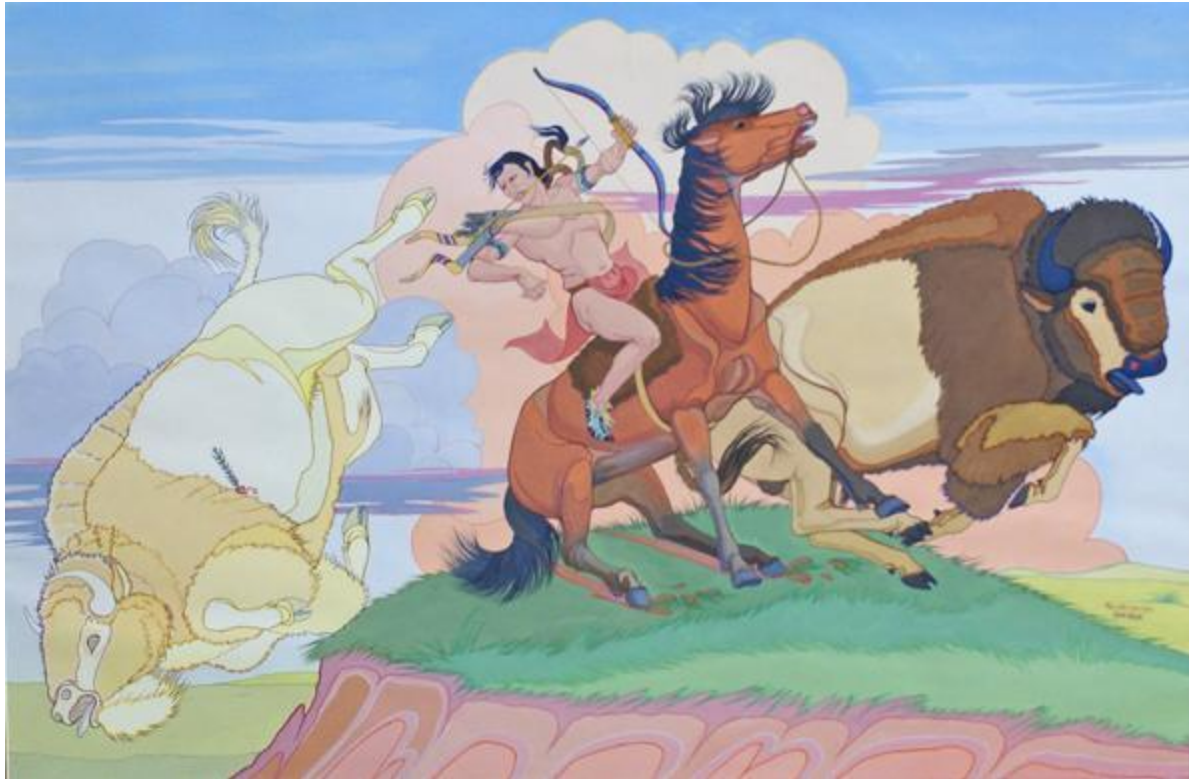
Dick West, 'White Buffalo, Wah Pah Nah Yah', gouache, 22" x 30", $12,500