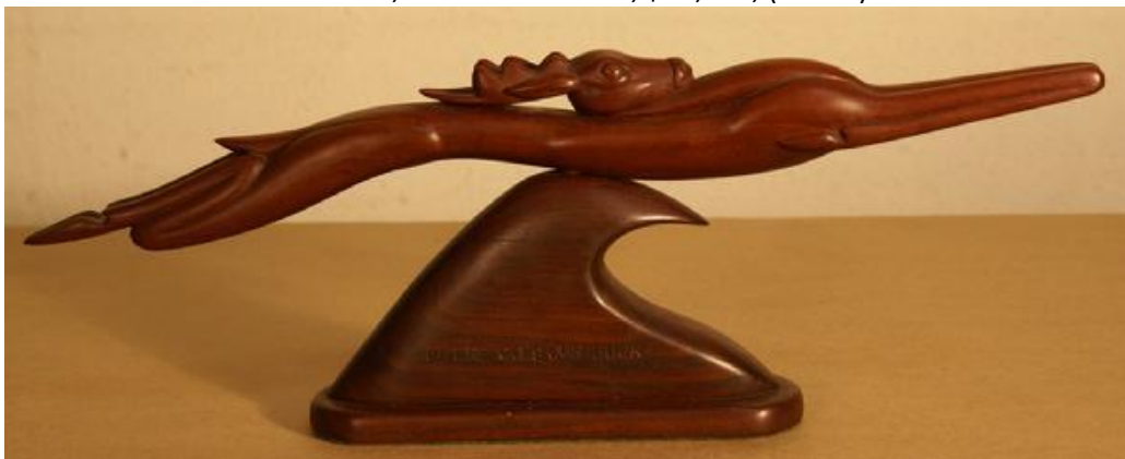
Willard Stone, 'There Goes Our Buck', (1978) Wood, 6" x 17 ¼" x 2 ¼", $13,000, (#3267)