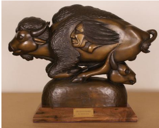
Willard Stone, 'Ghosts of our Prairie, 9/13, (1977), bronze, 14 ½" x 6" x 19", $16,000, (#3271)