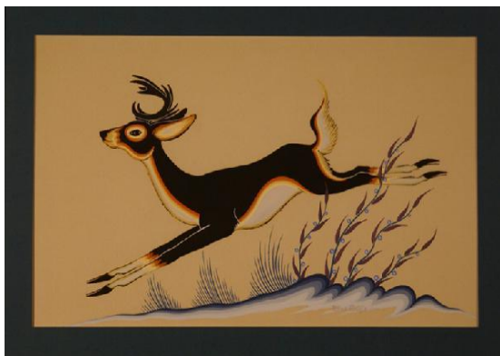
Acee Blue Eagle, untitled deer buck, Gouache, 9" x 15", $9,500