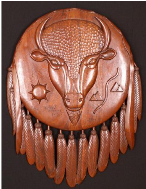
Jason Stone, 'Buffalo Medicine Shield', (1980) Wood, 27" x 20" x 2", $8,000, (#3288)