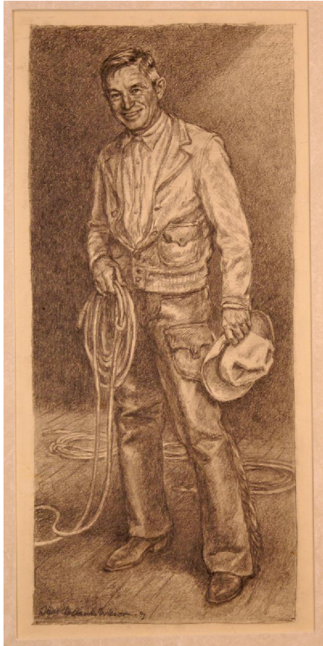
Charles Banks Wilson, pencil study for 'Will on Stage', (1993), 15" x 7" $10,000, (#3817)