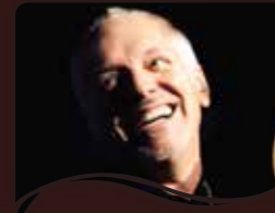
FRAMPTON'S GUITAR CIRCUS FRIDAY, JULY 19