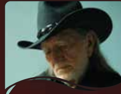
WILLIE NELSON FRIDAY, JULY 5