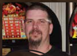
CHARLES G. $24,000

WE PAID OUT OVER $10.5 MILLION IN JACKPOTS IN APRIL