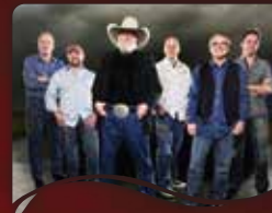
CHARLIE DANIELS | 38 SPECIAL FRIDAY, AUGUST 23