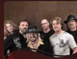
THE BAND PERRY SUNDAY, SEPTEMBER 1