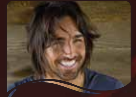
JAKE OWEN FRIDAY, AUGUST 2