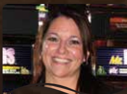
CONTESSA S. $12,500